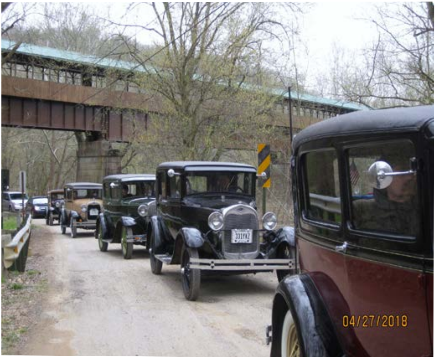
Copus Hill A's under the "Bridge of Dreams" - 2nd largest covered bridge in Ohio.